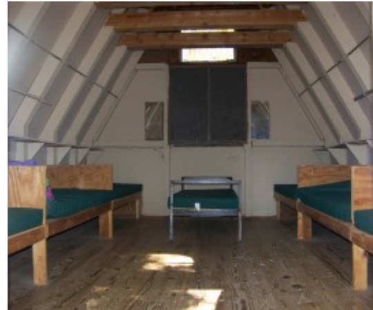
Photo of the old beds.

Online donations may be received through Givelify . Go to https://www.givelify.com (search "Camp Kum-Ba-Ya") or click here .